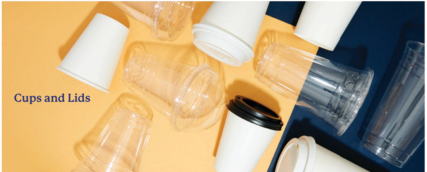
Cups and Lids